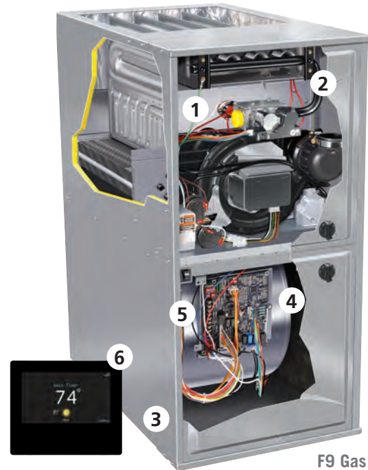
F9 Gas Furnace

Arcoaire gas furnaces are designed for durability and comfort. The warmth and efficiency of natural gas combined with a quiet, efficient blower motor delivers comfort throughout the cold seasons. The gas furnace can also be combined with an indoor evaporator coil and properly matched outdoor air conditioner or heat pump to provide cooling during the warm seasons.